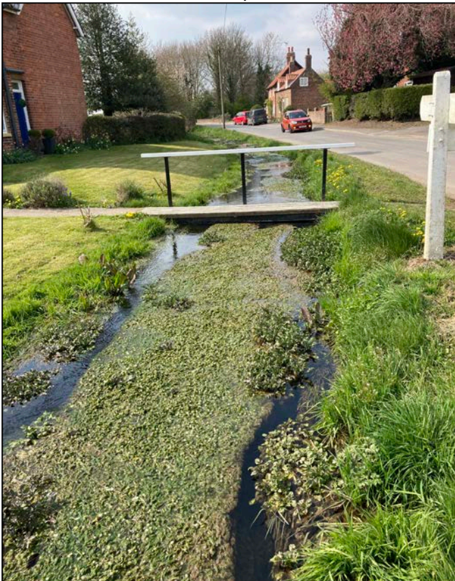
Before 22 April 2021