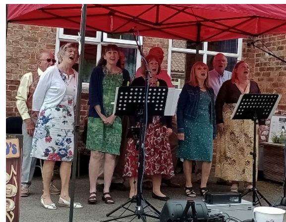
Middle 8 Singers