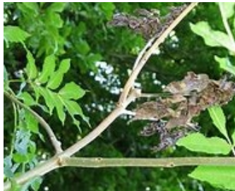
Ash die back examples