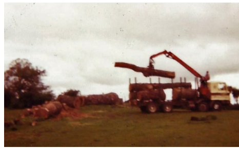
Dead Elms at Holly Farm