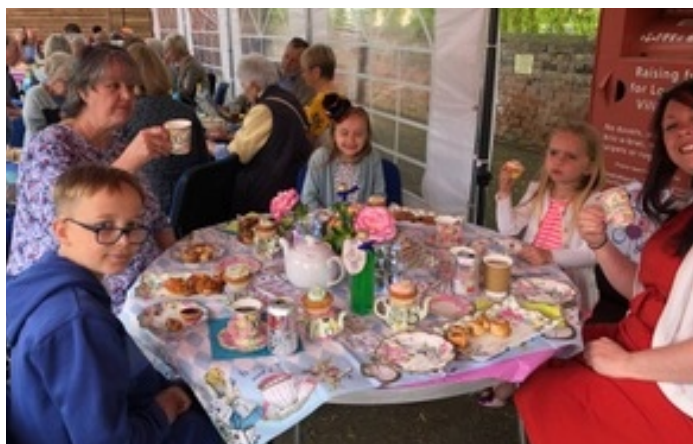
Best Dressed Table

Next year the Big Lunch coincides with the 80th Anniversary of D Day. Planning has already started to make this a special and memorable occasion.